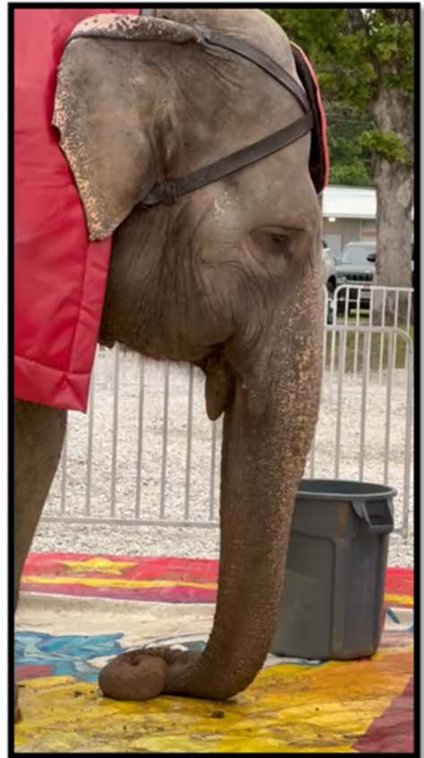
Figure 2: Betty's trunk, showing varying thickness and standard position with trunk tip on the ground