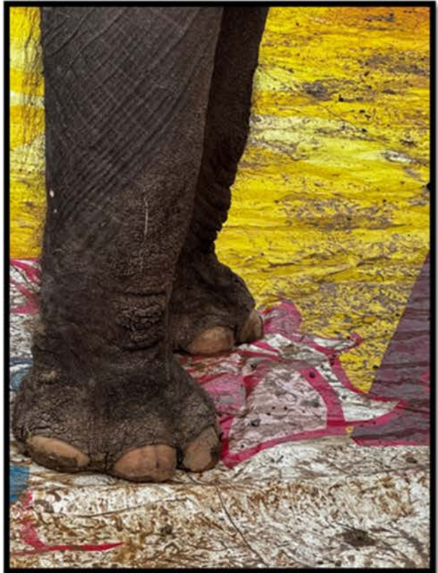
Figure 3: Janice's overgrown nails

While not substantially overgrown, Betty's feet had at least one, possibly two, nails on the RR (right rear) foot with a substantial crack. While it was not possible to observe the crack up close, this is a cause for concern depending on the crack's depth and the presence of infection in the foot. Cracked nails are often the result of a variety of problems in the elephant's living environment, and cracks can provide a route for acute or chronic infection. Such infections can cause serious and life-threatening problems in captive elephants such as abscesses or osteomyelitis.