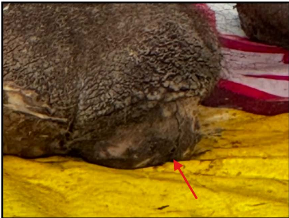
Figure 4: Betty's rear foot showing crack in nail (marked by arrow)