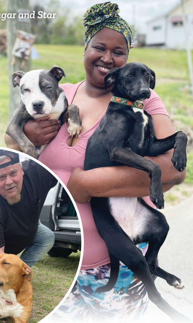
Sugar and Star

During this quarter, the veterinary staff on our mobile spay/neuter clinics sterilized 3,684 animal companions, including Diesel , Sugar , and Star , who were among the 199 animals PETA's Community Animal Project fieldworkers transported for free to and from their no-cost spay/neuter appointments. After Rudy sustained a deep laceration to the front of the chest, we treated the wound during his neuter surgery, free of charge for his adoring family.