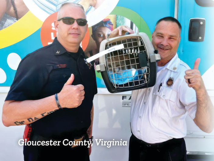
Gloucester County, Virginia

PETA's Mobile Clinics Division has spayed or neutered 244,283 animals since 2001.