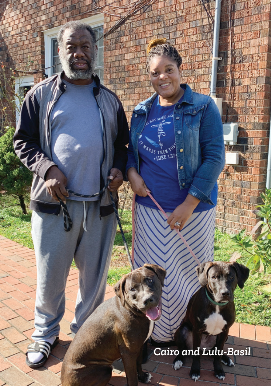
Cairo and Lulu-Basil

PETA's Mobile Clinics Division has spayed or neutered 213,390 animals since 2001!