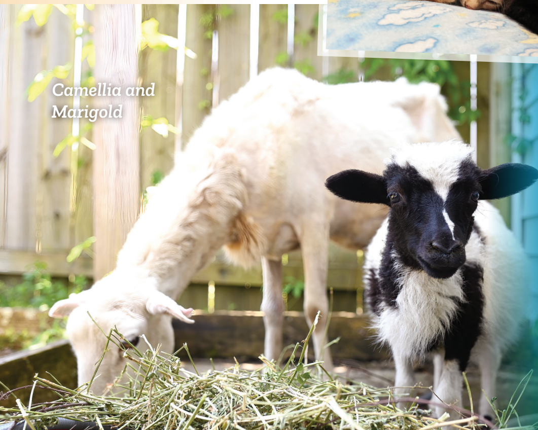
Camellia and Marigold

After a compassionate person called us about emaciated sheep kept in a barren pen at a rural convenience store, we talked to their owner, who agreed that their needs were not being met. Camellia and her lamb, Marigold , recovered in foster care while we found them a permanent home. Now they will spend their lives in comfort and safety among other sheep friends at Piedmont Farm Animal Refuge.