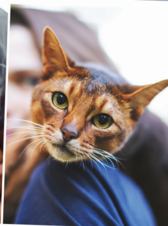
PETA | PEOPLE FOR THE ETHICAL TREATMENT OF ANIMALS

Goku's humans allowed him to roam outside, where he was allegedly attacked by a coyote. He sustained numerous puncture wounds including a hole in his skull. When he became emaciated and was on the brink of death, his infected wounds crawling with maggots, they called PETA for help with euthanasia.