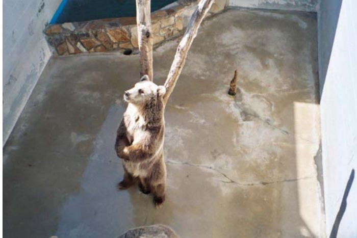
Begging Behavior Exhibited By Bear at Cherokee Bear Zoo in Cherokee, NC