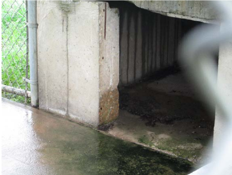
The concrete “den” at Jambbas Ranch is not only devoid of nesting materials, but is saturated with water to the point that algae is flourishing.