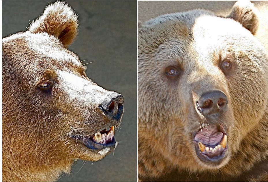
The lower-right canine teeth of grizzly bears at the Cherokee Bear Zoo have been worn or fractured down to the pulp cavity. The black areas inside the tooth are pulp cavity and dentin.