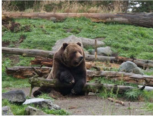
Naturalistic Bear Habitat at the AZA-accredited Woodland Park Zoo in Seattle, WA Provides Bears with Sufficient Space, Enrichment and Opportunities to Engage in Bear-Specific Behaviors