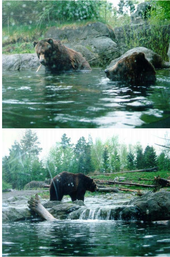
Bears at the AZA-accredited Woodland Park Zoo in Seattle, WA Have the Opportunity to Bathe, Cool Themselves, and Explore a Large, Naturalistic Pond

Bears like the bear formerly housed at Jambbas Ranch who was provided with only one small water source for bathing and for drinking are not only forced to ingest unsanitary water, but are deprived of the instinct to fully wash and clean themselves. Minimum bear husbandry practices require captive bears to be provided with a pool of swimmable size since many species of bears—including brown bears and black bears—have a genetic expectation to bathe, swim, and catch fish in their native habitats.