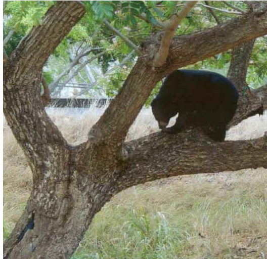
A bear climbs a tree to find peanut butter paste smeared on the upper branches in the naturalistic habitat at the AZA-accredited Honolulu Zoo.