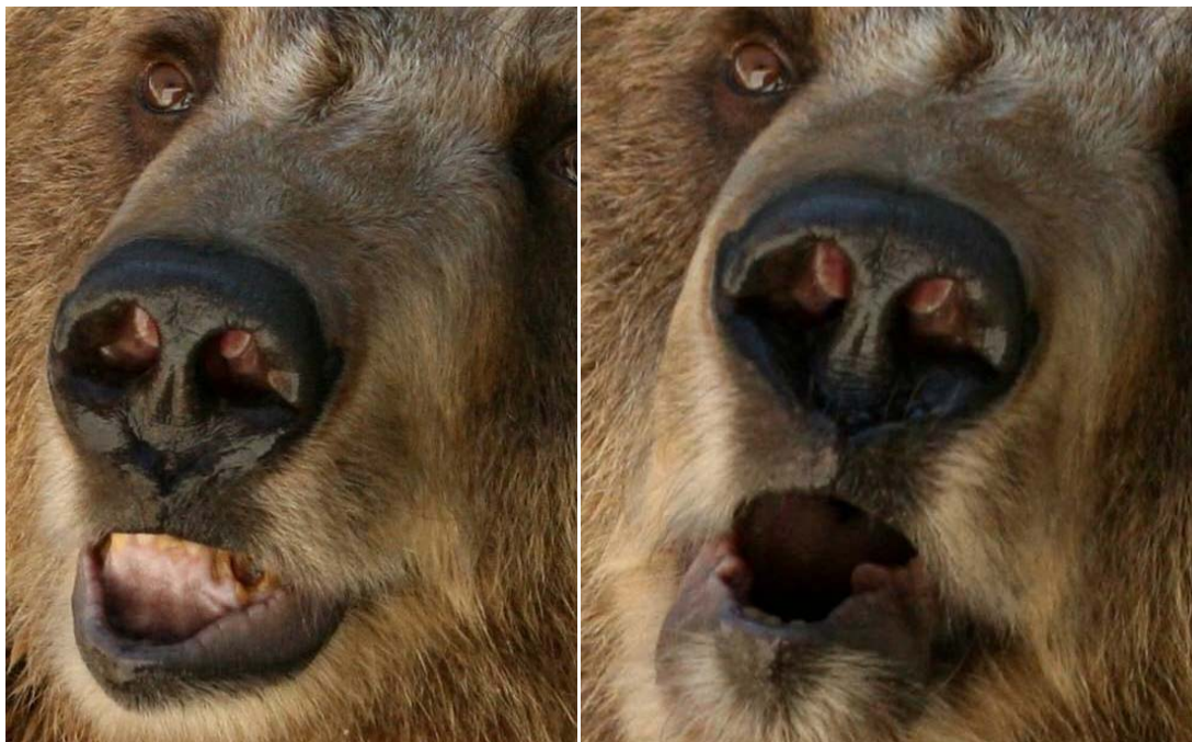
A grizzly bear at Chief Saunooke Bear Park had lost both lower canine teeth (notice how the lower lip folds in over the remaining lower teeth in the photo to the right). It appears