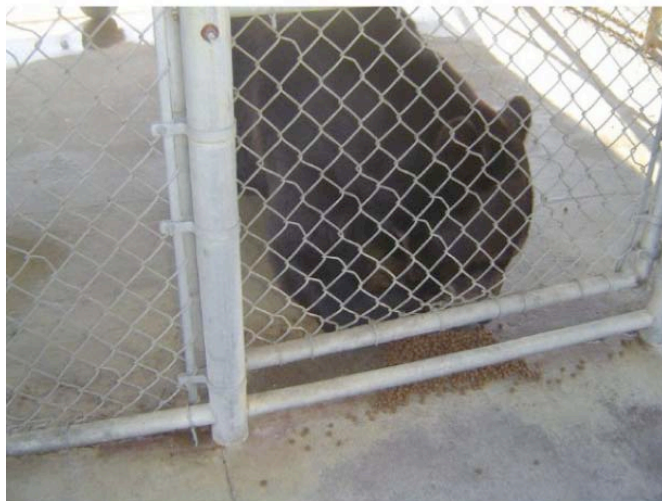
Ben, the Bear housed at Jambbas Ranch in Fayetteville, NC from September 16, 2006-August 9, 2012, Eating Single Pile Daily Feeding of Dry Dog Food

For example, at the Cherokee facilities, no consideration is given to the diversity of food that bears consume in the wild or to their complex foraging and food-acquisition activities. The main food item for the bears at these facilities is commercially prepared dog chow, fed to them at the same time each day, supplemented by whatever visitors feed them, which is predominantly dog chow, white bread, apples, and iceberg lettuce. (Laidlaw et al. 2010). Similarly, the bear housed at Jambbas Ranch for six years was fed a diet of commercial dog chow supplemented with white bread fed by visitors. Presumably, these foods are used because they are the cheapest to purchase, but they provide little nutritive value to the bears.