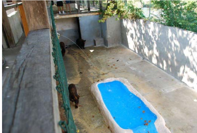
Bears Kept in Barren, Wet Pit at the Chief Saunooke Bear Park in Cherokee, NC (License No. 55-C-0125)

Oakridge Exotics (33-C-0007) in Smithfield, Illinois; Predators in Action (93-C-0350) in Big Bear City, California; Everglades Wonder Gardens (58-C-0483) in Bonita Springs, Florida; Waccatee Zoo (56-C-0230) in Myrtle Beach, South Carolina; Natural Bridge Zoo (52-C-0035) in Natural Bridge, Virginia; Maple Lane Wildlife Farm (32-C-0178) in Topeka, Indiana; and Forest Park Zoo (14-C-0003) in Springfield, Massachusetts. 1