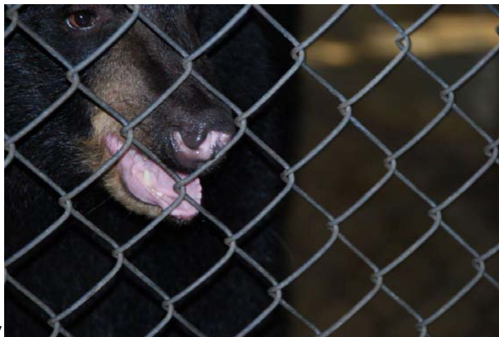
A Bear Caged at Santa's Land in Cherokee, NC Bites at the Chain Link Fence Enclosure

lesions, is further increased by captive bears who habitually grip or bite the vertical bars of their cages with their teeth, which causes pulp exposure and the abrasion of the canine teeth of the bears' upper and lower jaws. (Wenker et al. 1999; Wenker et al. 1998). Poor dental care may also lead to chronic pain, tartar, gingivitis, apical abscessation (toothroot abscess), osteomyelitis (infection of the bones in the face), and bacteriaemia (entry of bacteria into the bloodstream). Bacterial infections may precipitate additional serious and painful conditions including endocarditis (inflammation of heart valves), glomerulonephritis (kidney disease), and uveitis (painful ocular infection). (E-mail from E. Poulsen to Carney Anne Chester, PETA Foundation, June 21, 2012) (Exhibit 14).