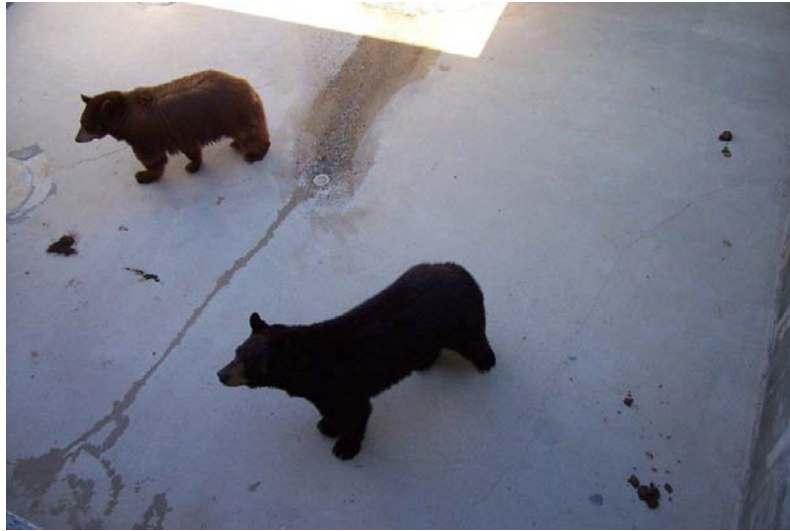
Concrete Bear Pit at the Black Forest Bear Park, Completely Devoid of Enrichment

that stimulates the bears' senses and allows the bears to engage in genetically driven behaviors.