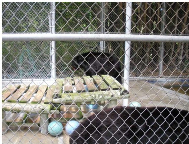
Multiple Bears Exhibited in Small, Unnatural Concrete and Chain Link Cage at Everglades Wonder Garden in Bonita Springs, FL (License No. 58-C-0483)

Simply put, nothing in nature prepares a bear to live in an environment as alien, hostile, and austere as a cement pit or slab, and the consequences on the bears' mental and physical health are predictably dire ( see infra V.B).