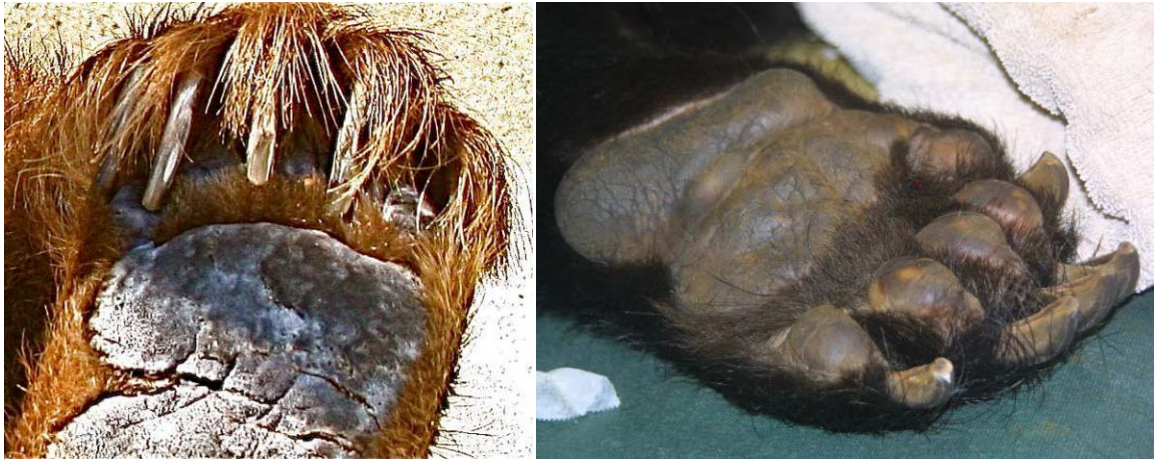
Cracks in the rear footpad of a grizzly bear at Cherokee Bear Zoo (l) and a normal footpad (r)

Bears who are kept exclusively on concrete and other unyielding surfaces and are unable to engage in regular exercise as they would in the wild, are also at greater risk of developing arthritis and skeletal disease. (Kitchener et al. 2000; Laidlaw et al. 2010). Micro-traumas that occur over time, associated with repetitive movements, overuse, and/or overloading of the musculoskeletal system, put captive bears kept in such conditions at high risk for progressive cartilage loss, inflammation, and bony changes in their neck, spine, and joints. The chronic pain associated with osteoarthritis further limits mobility in these already exercise-deprived bears, which leads to more debilitating weight gain. The bears housed at Chief Saunooke Bear Park, Santa's Land, and Cherokee Bear Zoo in Cherokee, North Carolina; Jambbas Ranch in Fayetteville, North Carolina; Black Forest Bear Park in Georgia; the Ober Gatlinburg Bear Exhibit in Gatlinburg, Tennessee; and the Three Bears Gift Shop in Pigeon Forge, Tennessee are forced to live on concrete—which is frequently saturated with moisture—and are totally deprived of access to natural substrates.