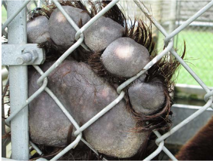
The footpad of the declawed bear housed for nearly six years at Jambbas Ranch in Fayetteville, NC has been worn down to the pink in various spots from years living on an unyielding concrete surface.