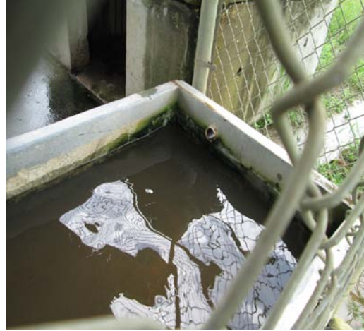
The bear housed at Jambbas Ranch for six years had one small metal water receptacle for bathing and drinking (l); the water receptacle was covered in algae and the water was brown, opaque, and putrid (r).