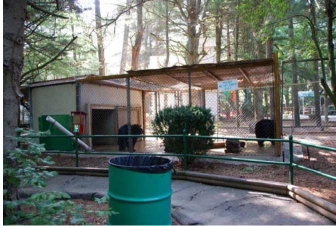
Multiple Bears Exhibited in a Small, Unnatural, Concrete and Chain Link Cage at Santa's Land in Cherokee, NC (License No. 55-C-0238)