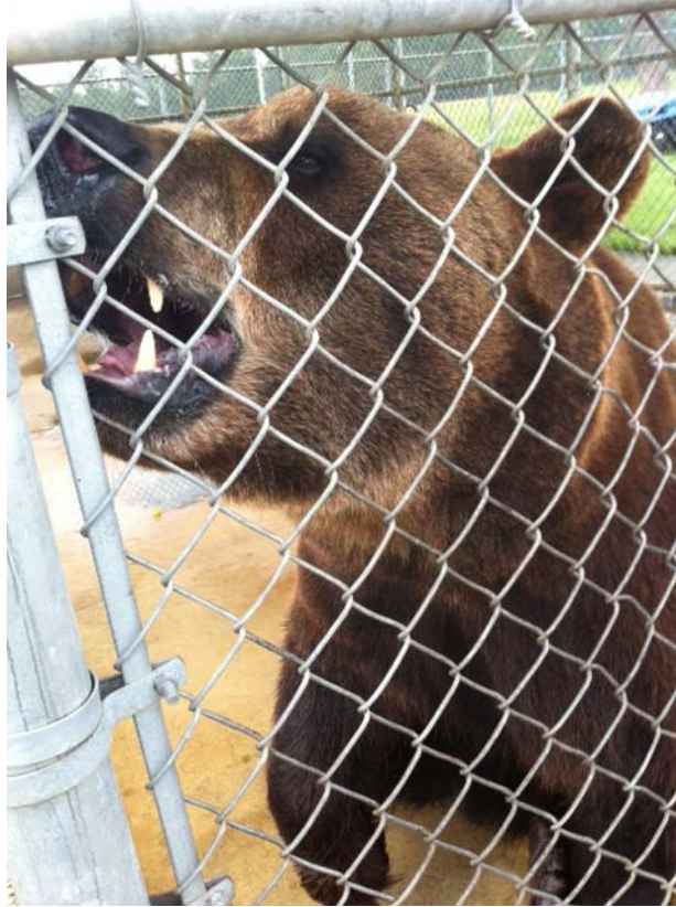
The bear housed at Jambbas Ranch in Fayetteville, NC exhibited frequent cage-biting behavior.