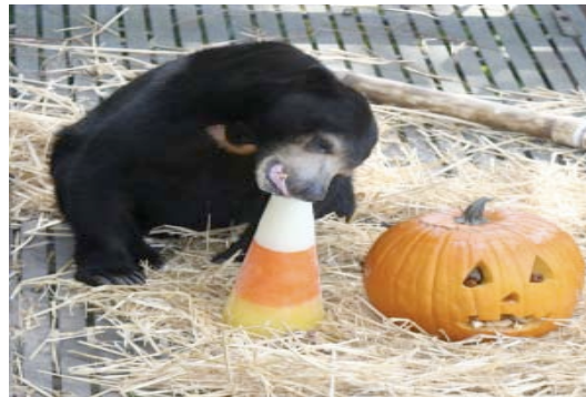
A bear enjoys a Halloween-themed frozen treat at the AZA-accredited Oakland Zoo.

Similarly, research has demonstrated that providing nesting material in both indoor and outdoor areas, in the form of straw, wood-chippings, branches, or leaves can stimulate natural digging and play-behavior and decrease abnormal behavior. Providing these substrates is particularly important in enclosures that are not primarily covered with natural ground cover. (Meyerson 2007; L. Kolter et al.).