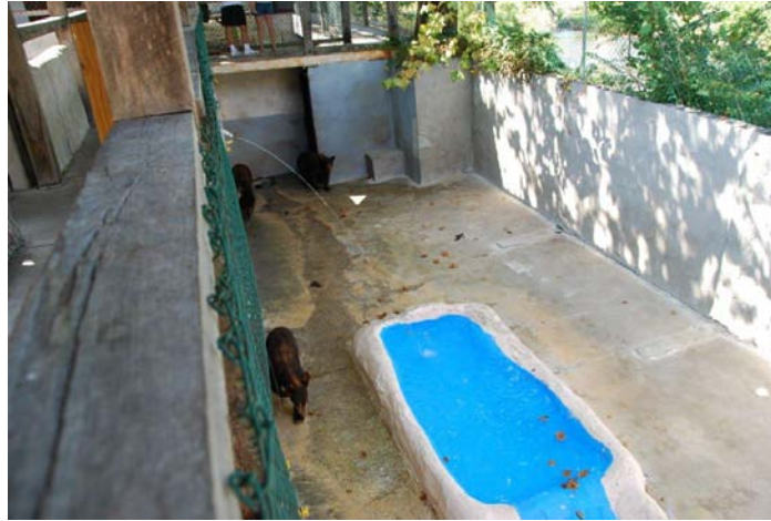
Bears at the Chief Saunooke Bear Park Exhibited in a Barren, Concrete Pit Without Enrichment, Adequate Space, or Visual Barriers