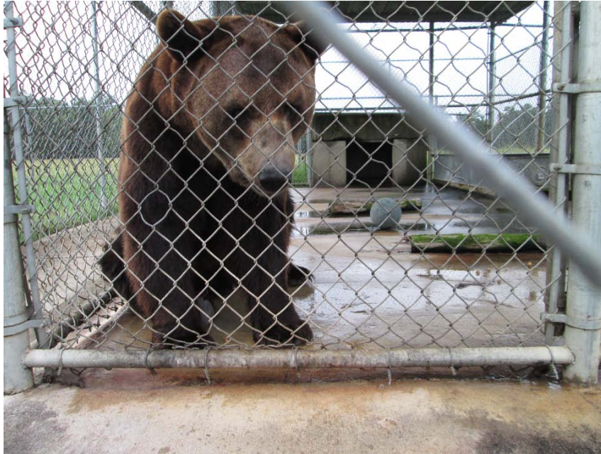
Ben the Bear Was Housed in a Virtually Barren, Often Wet, 12' x 22' Concrete and Chain-Link Cage at Jambbas Ranch in Fayetteville, NC for Six Years

(24.52 square meters) until local citizens filed a civil cruelty to animals lawsuit and obtained a court order requiring Ben's immediate transfer to an reputable sanctuary. (Bradshaw 2011; see also infra VII).