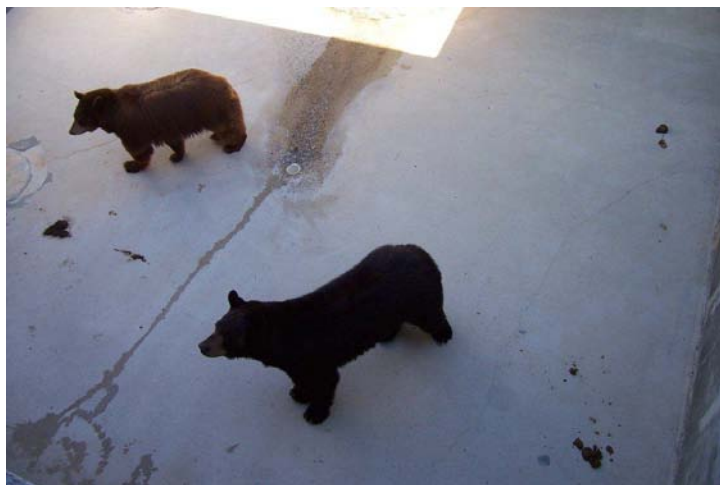
Bears Kept in Barren, Concrete Pit at the Black Forest Bear Park in Helen, GA (License No. 57-C-0176)