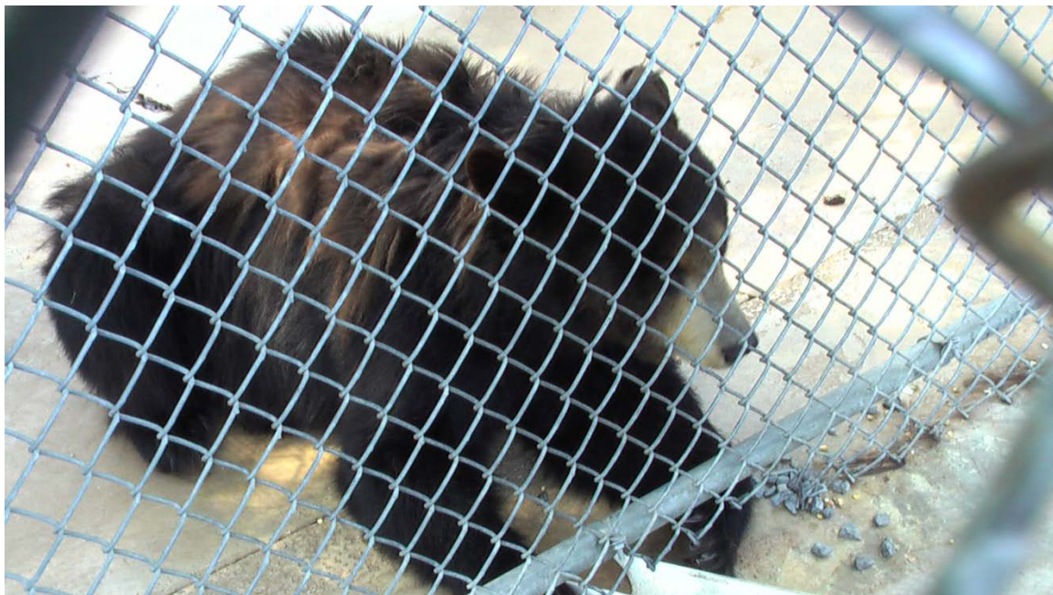
This bear exhibited at Jim Mack's Ice Cream in York, PA has large clumps of matted fur clinging to her in late July because the cage has no pool and nothing for her to rub against to help her shed properly.