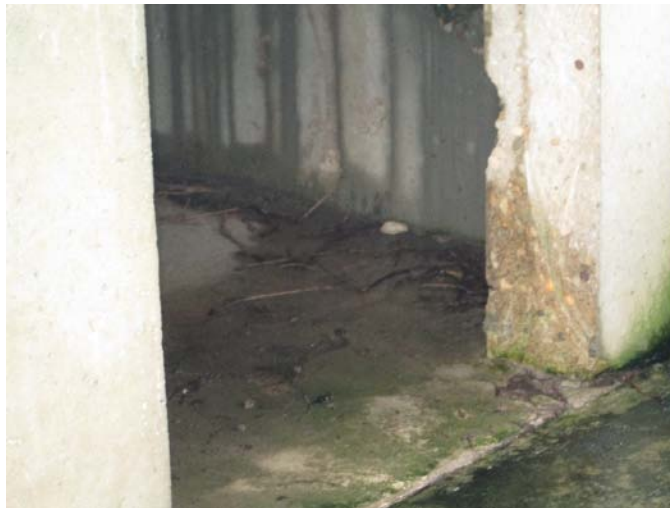
Another view of the concrete “den” at Jambbas Ranch.