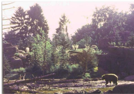
Naturalistic Bear Habitat at the AZA-Accredited Woodland Park Zoo in Seattle, WA