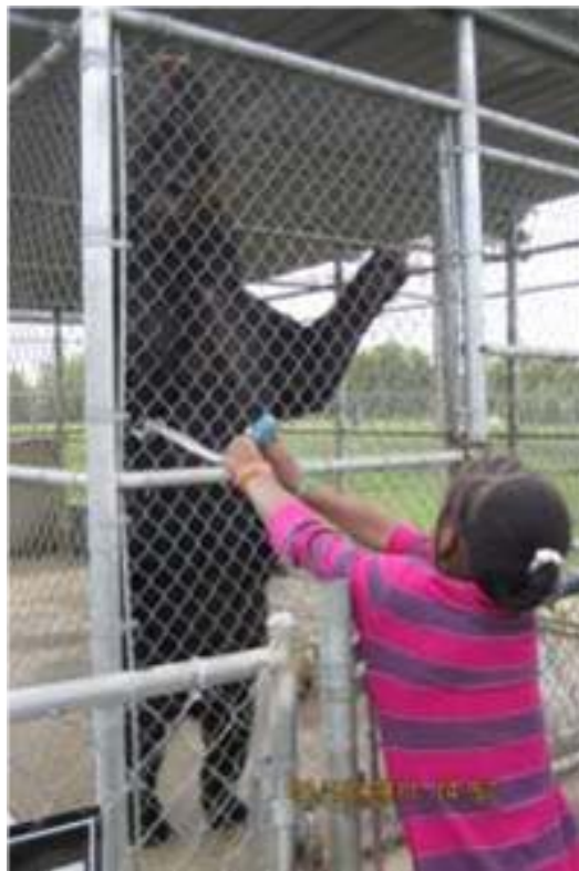
Begging Behavior Exhibited by the Bear formerly housed at Jambbas Ranch in Fayetteville, NC While Being Fed by a Visiting Child.