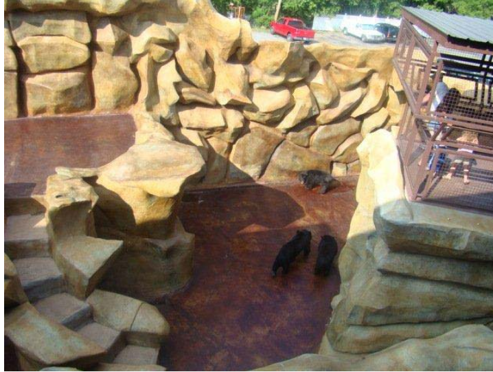
Bears Kept in Barren, Concrete Pit at the Three Bears Gift Shop in Pigeon Forge, TN (License No. 63-C-0103)