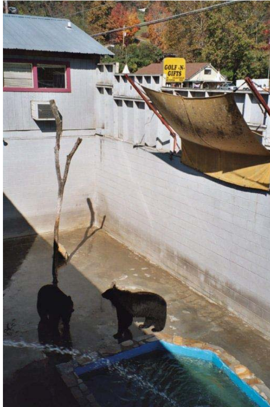
Bears Kept in Wet, Barren Pit at the Cherokee Bear Zoo in Cherokee, NC (License No.55-C-0118)