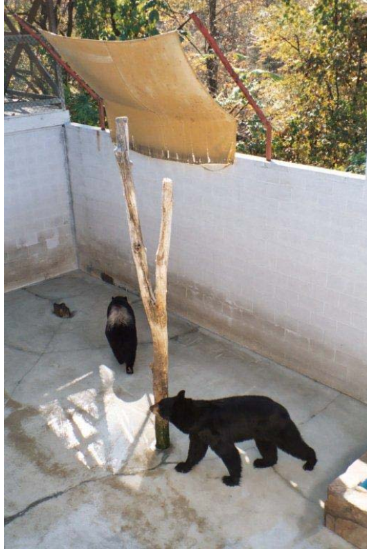
Black Bears Kept in a the Concrete Pit at the Cherokee Bear Zoo in Cherokee, NC, Deprived of Instinctive Denning Opportunities