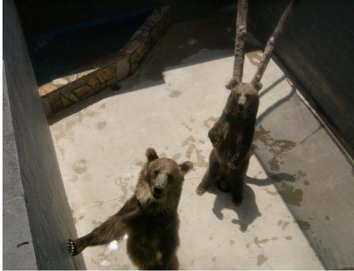
Bears Kept Exhibiting Begging Behavior at the Ober Gatlinburg Exhibit in Gatlinburg, TN (License No. 63-C-0021)