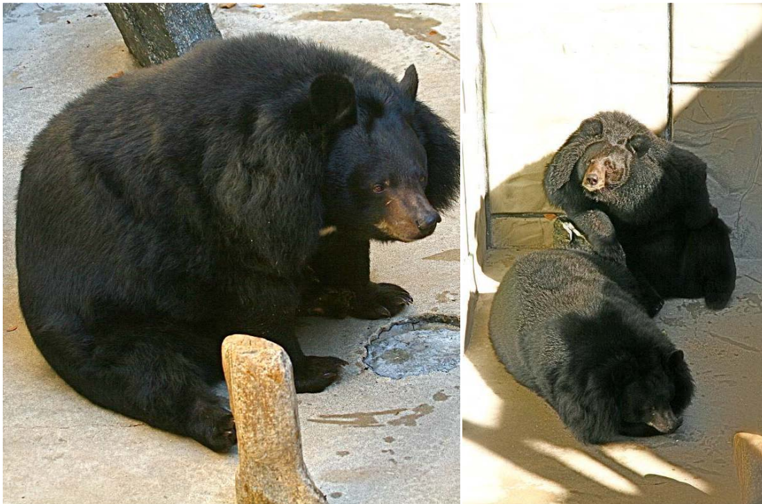
Obese Asiatic black bears at Chief Saunooke Bear Park in Cherokee, NC