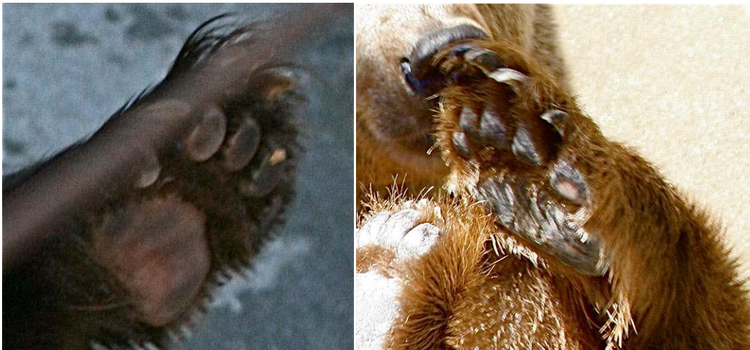
Apparent forepaw lesions on a black bear at Chief Saunooke Bear Park (l) and a grizzly bear at Cherokee Bear Zoo (r)

In cases in which calluses have not had time to develop or animals demonstrate stereotypic behaviors such as pacing on concrete floors, footpads are subject to thinning and the formation of blisters and ulcers. Exposed soft tissue and unprotected nerve endings can result in secondary infection or extremely painful sores that heal poorly or re-flare because of constant weight-bearing. (Laidlaw et al. 2010). In addition, excessive pressure on limbs and tissue caused by the unyielding concrete floor leads to bruising, discomfort, and circulatory compromise. A bear would normally construct a day bed or den by digging into dirt. Naturally, therefore, a bear's tissue suffers excessive pressure when the animal is forced to rest his or her considerable mass on rock-hard surfaces. (Laidlaw et al. 2010).