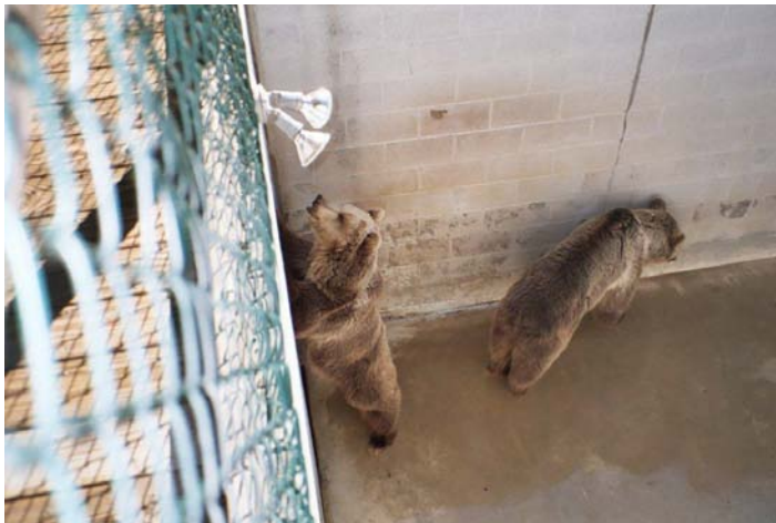
More Begging Behavior Exhibited By Bear at the Cherokee Bear Zoo