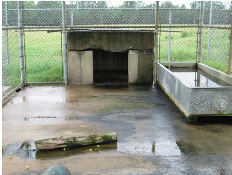
Bear Enclosure at Jambbas Ranch in Fayetteville, NC, Devoid of Denning or Nesting Materials

branches, straw, hay, and wood wool, all in substantial amounts to significantly cushion and insulate the bears. (Laidlaw et al. 2010).