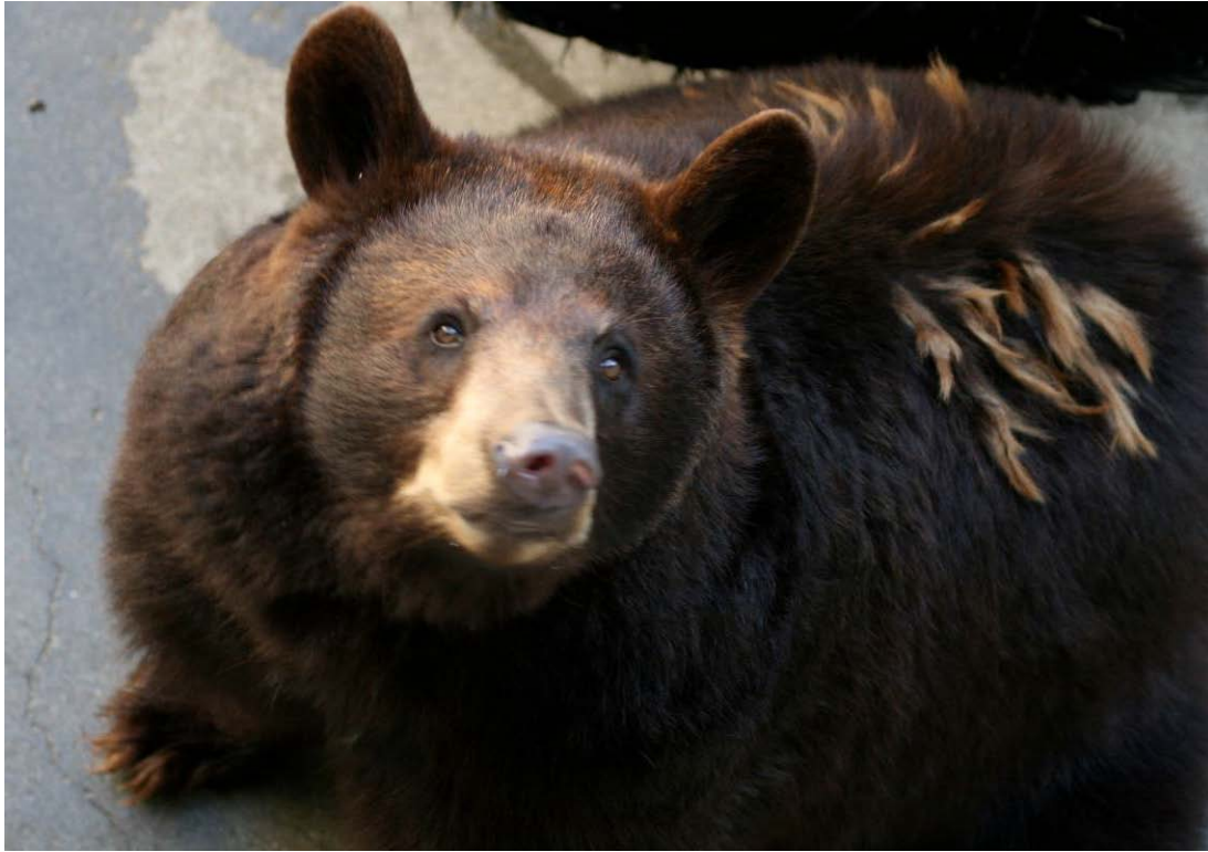
This bear at Chief Saunooke Bear Park in Cherokee, NC has matted fur and has not shed out properly because there is a lack of appropriate surfaces to rub against.