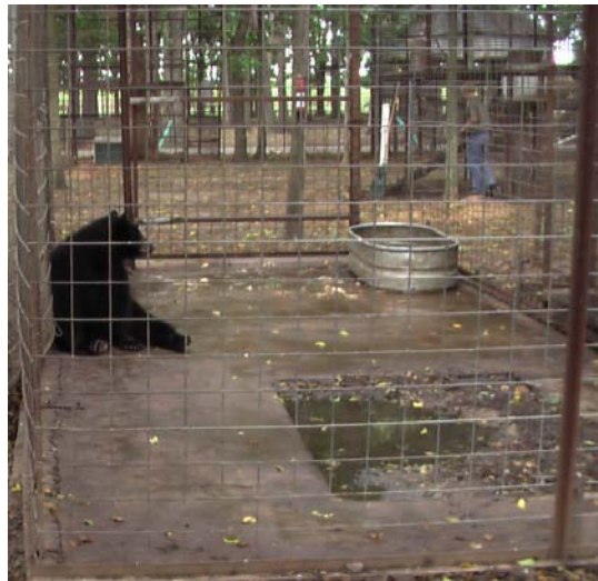
Solitary bear exhibited at Maple Lane Wildlife Park, Without Enrichment, Adequate Space, or Visual Barriers