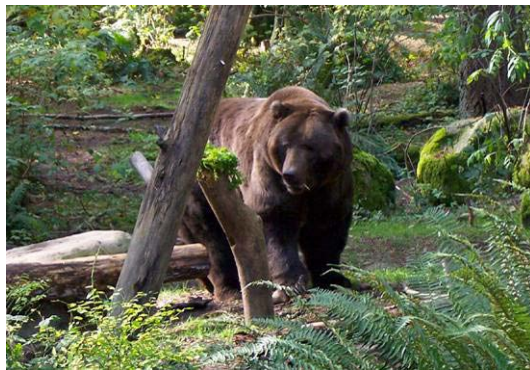
Naturalistic Bear Habitat at the AZA-accredited Northwest Trek Wildlife Park in Tacoma, WA