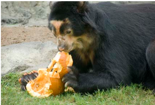
A bear tears apart a hollowed-out pumpkin containing honey and fruit at the AZA-accredited Houston Zoo.

Among other things, hiding food in a way that encourages natural foraging behavior has been shown to substantially reduce stereotypic behavior in captive bears. To avoid physical and mental starvation and the concomitant aberrant stress behaviors such as pacing—bears should be provided with enrichment objects full of foods, so that the bear can perform investigative appetitive behavior. ( See also infra at Section VI.B.).