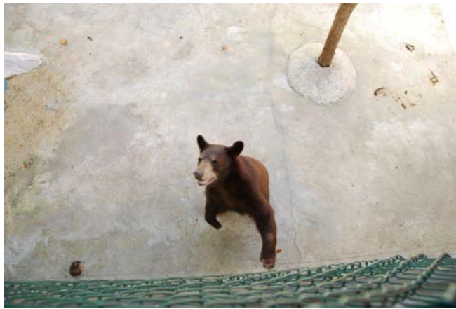
The View Down into a Bear Pit at Chief Saunooke Bear Park in Cherokee, NC

thus exposed creates a constant, never-ending stressor for the captive bears. Bears exhibited in sunken pits at the Three Bears Gift Shop, Cherokee Bear Zoo, and Chief Saunooke Bear Park face the additional stress of having visitors throw food at them, often clearly aiming to hit them.