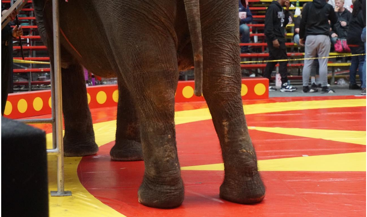
Ulcer on inner right rear leg of elephant