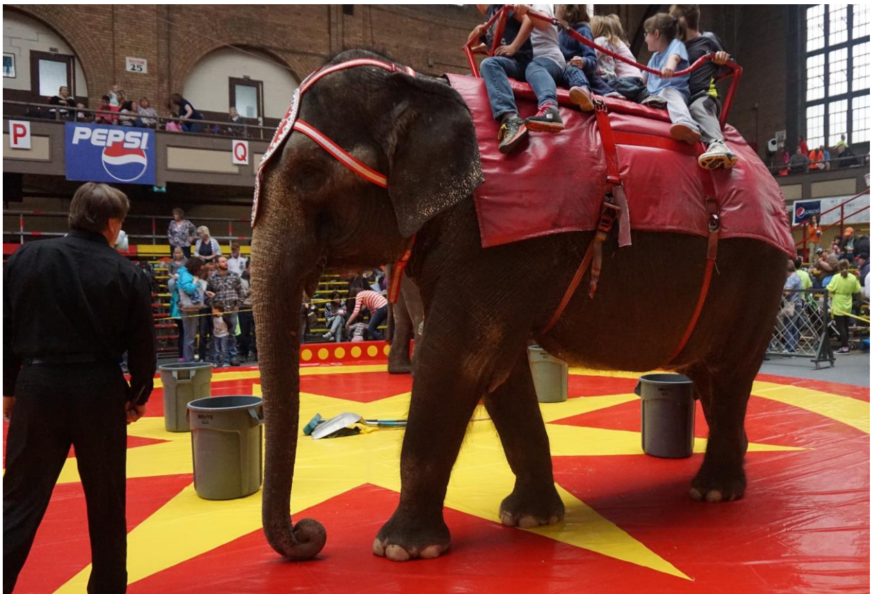
Wound on left side of elephant's trunk