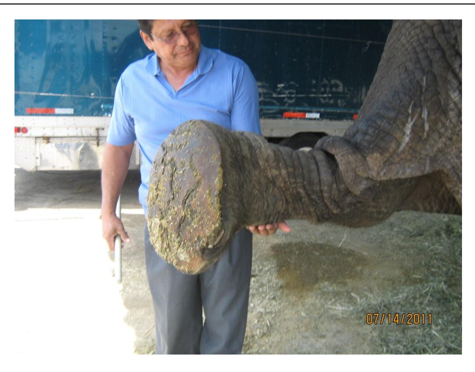
[Photo 1] Improperly trimmed to begin with, this elephant's sole has worn unevenly, resulting in discoloration of the foot pad. Feces and other debris are caked into the grooves in her feet.