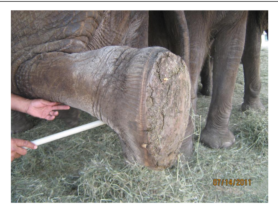
[Photo 3] Elephants have a natural cushion in their feet that helps support their massive bodyweight. However, when the soles of their feet lose their pliability and begin to dry and crack out like this pad has, each step can be painful as it is forced to bend under them.