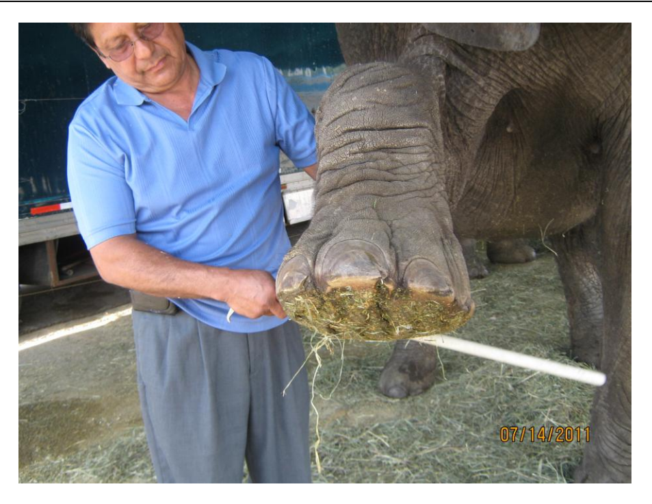
[Photo 4] The bottom of this elephant's foot is caked with feces and other debris. The condition of her nails also requires veterinary care.