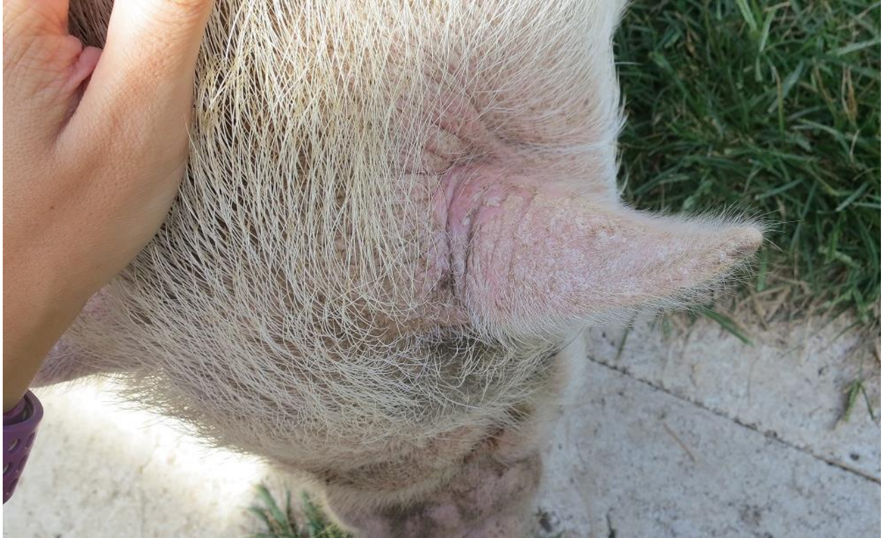
Photo 2: Pig with redness around the periorbital region and behind the ears, indicative of sunburn or other skin pathology.