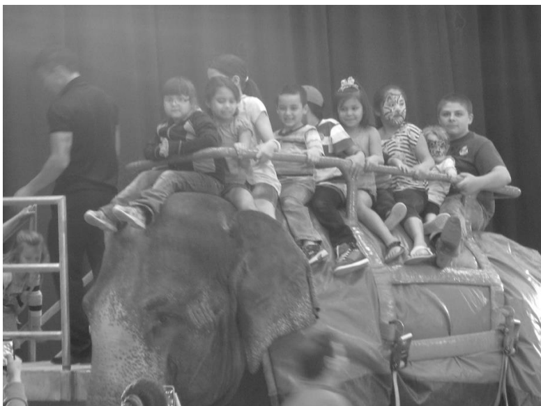
Asian elephant Carol demonstrated pain, discomfort and lameness when providing rides during a circus event on May 5, 2015 in Pueblo, Colorado.