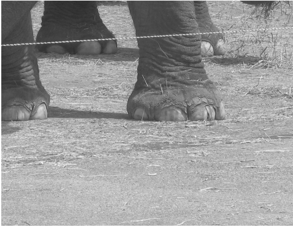
Assan's vertical full length left front toe nail crack documented on June 7, 2015

Asian elephant Mable was also documented at the Colorado Springs World Arena with a left rear vertical toe nail crack.