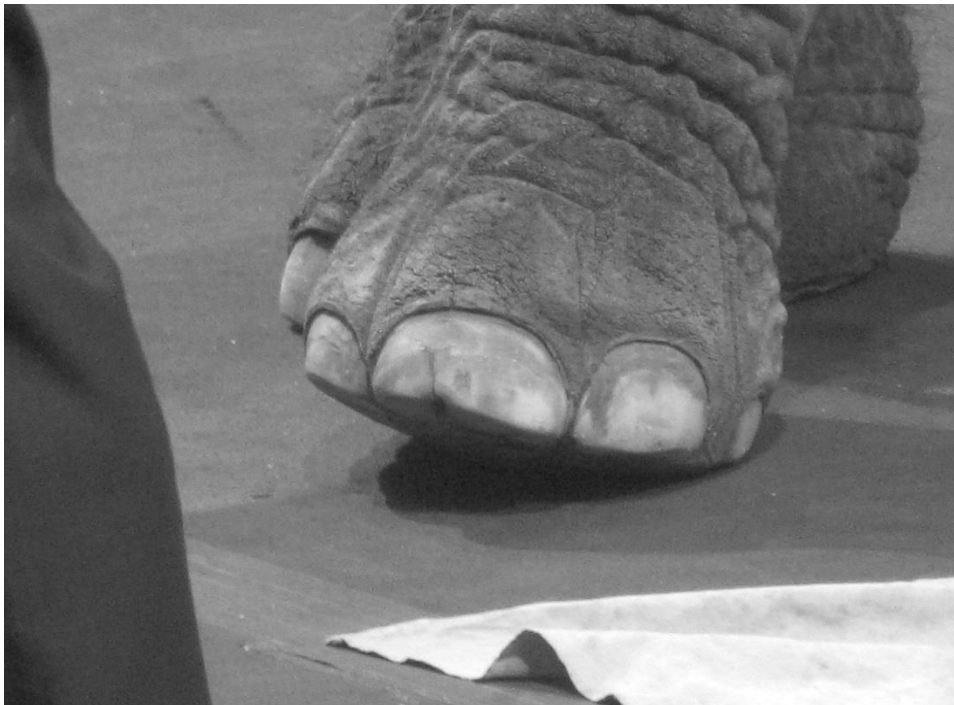
Mable's left rear toe nail crack documented in Colorado Springs on June 7, 2015

Asian elephant Mable was also documented at the Colorado Springs World Arena with a left rear vertical toe nail crack.