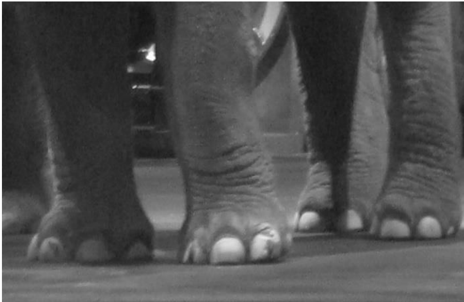
Nichole's vertical toe nail abscess is better appreciated as a dark blackened area on the face of the left front medial toe nail during the main elephant performance at the Philips Arena on February 11-13, 2015.