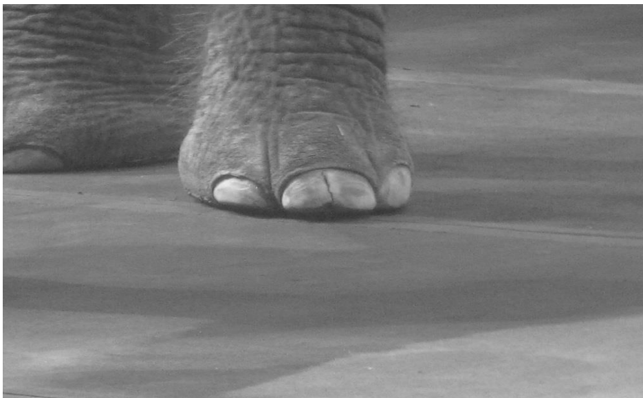
Close up of the chronic toe nail crack on Mable's left rear foot as it appeared on October 11, 2015 revealing the crack had progressed the full length of the nail as compared to when she appeared in Colorado Springs four months previous on June 7, 2015.

One of Ringling Brothers Asian elephants observed both in Colorado Springs and again at the Denver Coliseum was documented with a sole protectant compound on the soles of her front