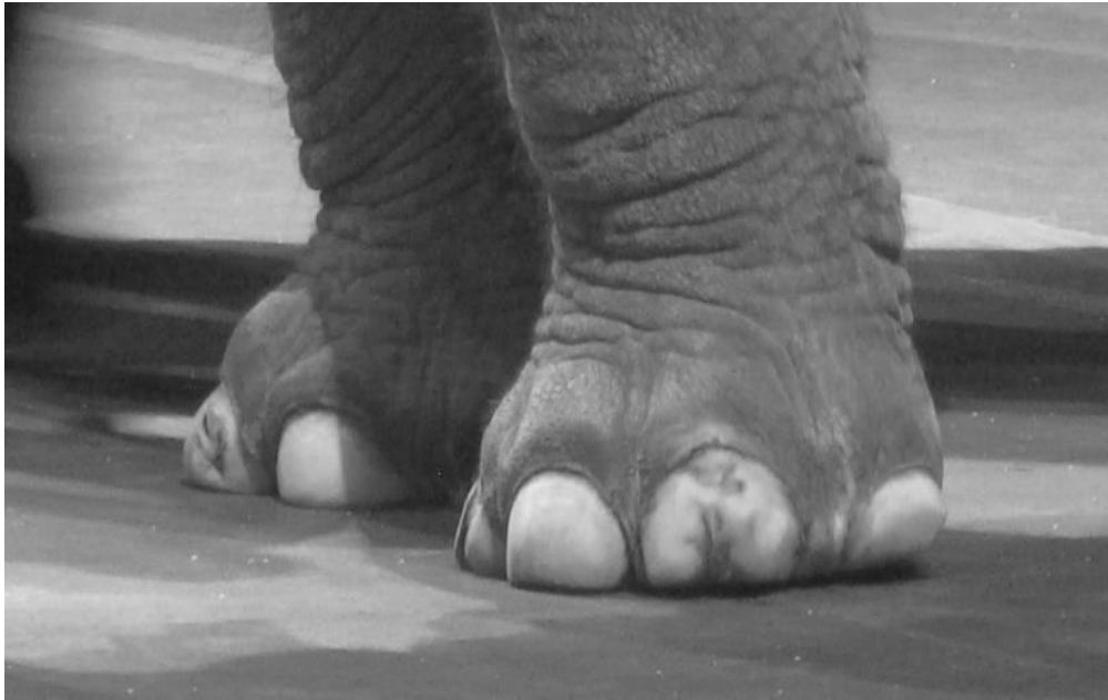
Close up of Nichole's left front foot on February 11-13, 2015 revealed a full vertical nail bed abscess seen on the medial most visible toe nail on the near appearing left front foot