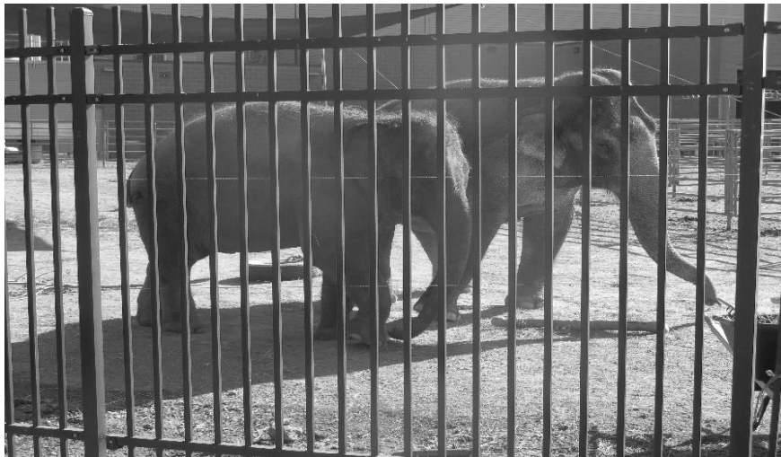
April on the left and Asia on the right between performances in a holding area where Asia was videoed while demonstrating stereotypic weaving back and forth behavior on September 12, 2015, in Loveland, Colorado.

Two Ringling Brothers and Barnum & Bailey Circus Asian elephants Asia, 47 years of age, and April, 5 years of age, were observed between performances on September 12, 2015, in Loveland, Colorado. Video documentation during two performances revealed an abnormal gait in the younger elephant April. Asia has a long history of limping, limb stiffness, lameness, cuticle abscess, toe nail cracks, ear wounds, radiographic evidence of digital fractures, and bull hook wound punctures. 5