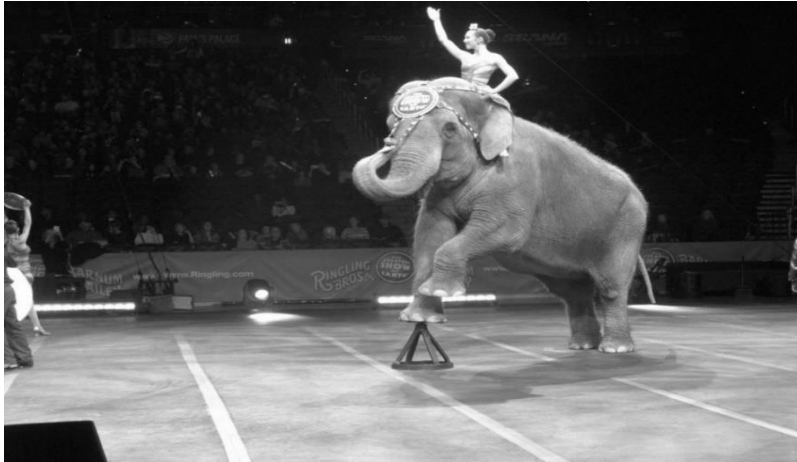
Karen performing on a spindle placing increased weight on her split left rear toe nail at the Philips Arena on February 11-13, 2015