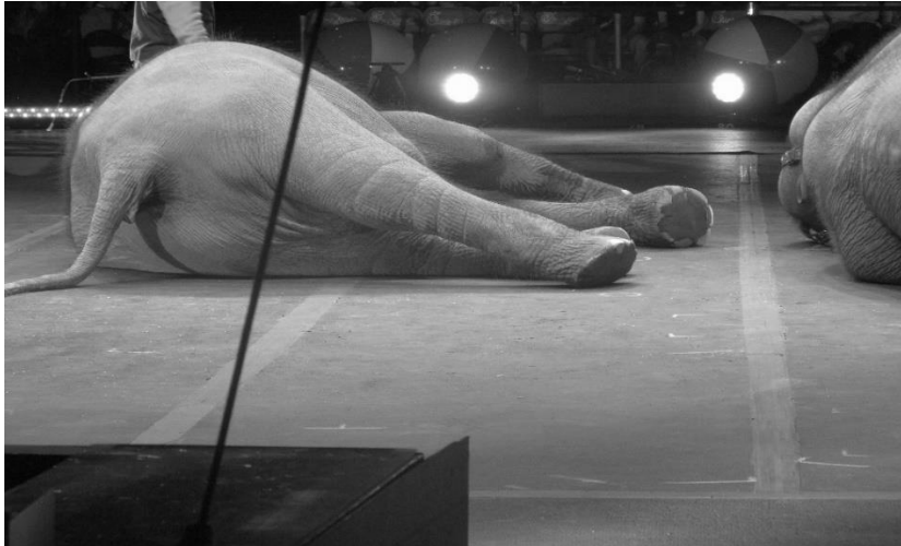
A sole protectant compound is clearly visible on the sole of this Ringling Brothers Circus elephant's left front foot noted in Colorado Springs in June, 2015 and again in Denver in October, 2015.

feet. This is a horse hoof care product developed for support of an unshod horse foot to create a protective coating that bonds to the foot. In elephants this is done in cases of uneven or over worn soles of the feet.