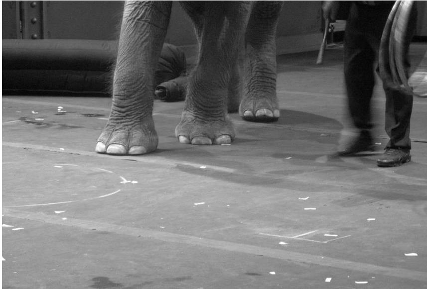
Mable placing less weight on her left rear foot at the Denver Coliseum on October 11, 2015

Of interest when the Ringling Brothers Asian elephants were seen in Colorado Springs in June 2015, then observed in Denver on October 11, 2015 at the Denver Coliseum, the elephant Mable with the left rear toe nail crack appeared to demonstrate greater discomfort and pain. At the Denver Coliseum she placed even less weight on the left rear foot.