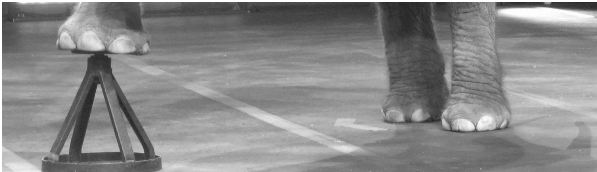
Close up of Karen's unhealed split left rear foot toe nail documented in the photograph directly above

Two elephants, Karen and Nichole, were seen during each main elephant performance.