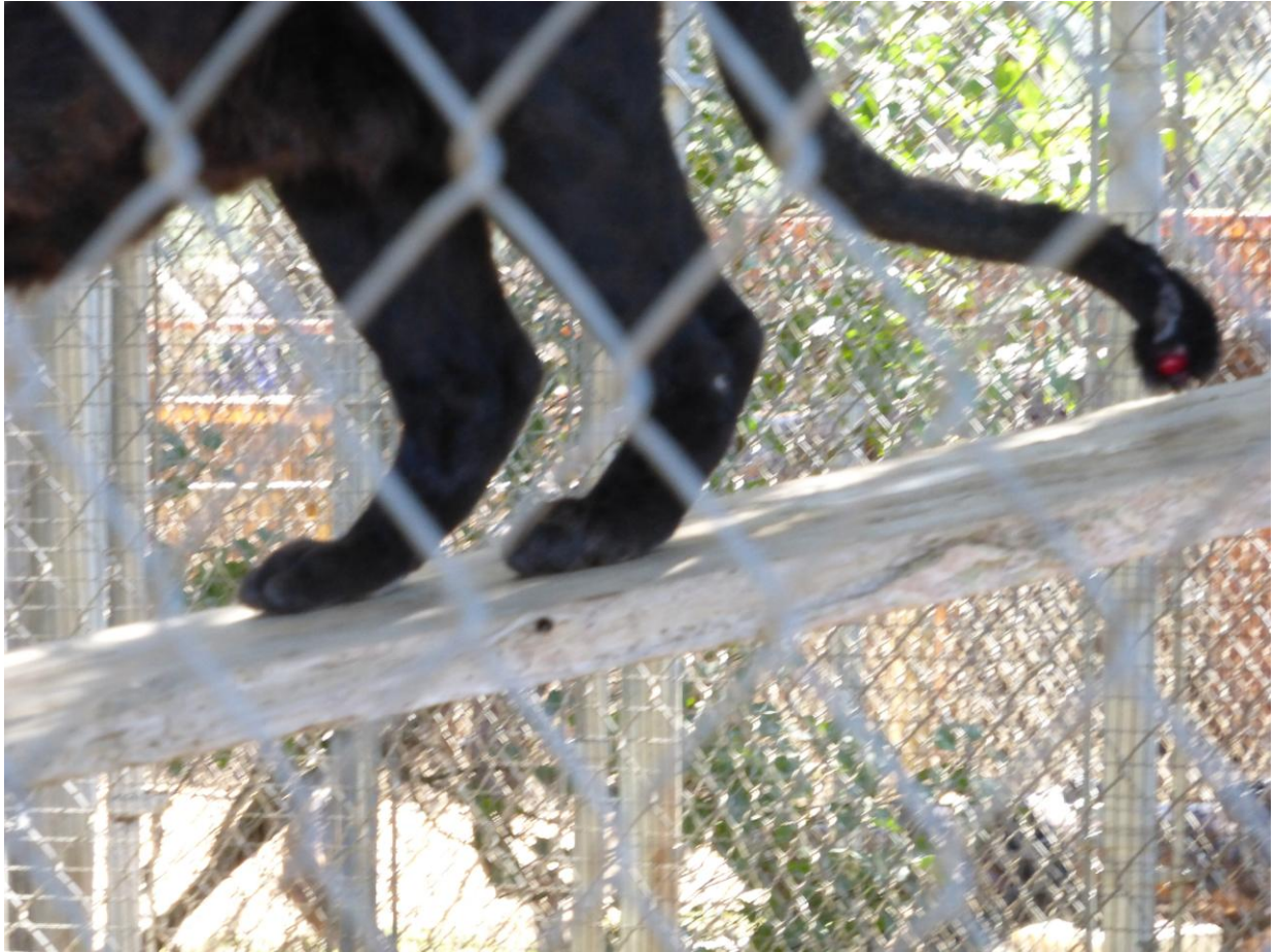
Leopard with a raw, bloody wound on the end of his tail