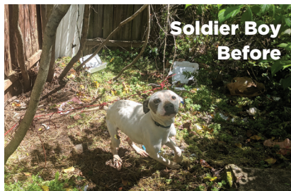
Soldier Boy Before