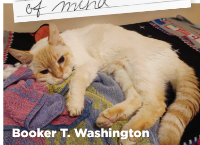
Booker T. Washington

Thanks to Peta my cat is at peace and I have peace of mind.