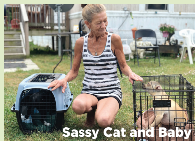
Sassy Cat and Baby