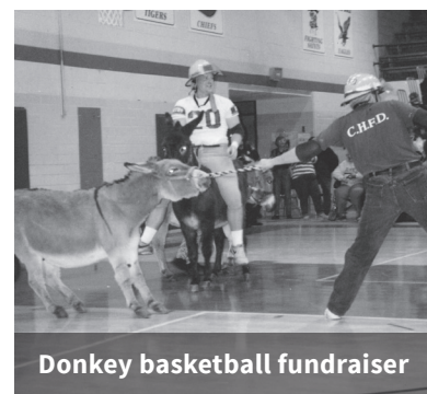
Donkey basketball fundraiser

Animals' normal behavior can't be observed in most artificial environments, because their basic needs aren't being met there—so visiting an unaccredited aquarium, a circus, a marine park, or a roadside zoo on a field trip doesn't actually teach students about animals. And when it comes to fundraisers, don't force animals to be involved in your plan. Donkey basketball games—abusive spectacles in which participants ride on the backs of terrified animals—send the message that animals are nothing more than props, as do cruel “incentives” such as having a teacher or principal swallow a live worm or goldfish if students raise a certain amount of money.