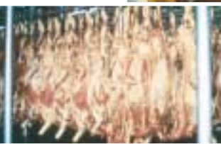
Cows used for leather endure broken bones, beatings, hunger, and thirst.